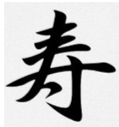
kotobuki (long life, congratulations)