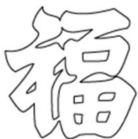
fuku (good fortune)

Choose which symbol is more relevant for your goal: